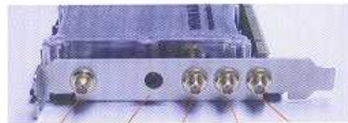
Ext. Ref. In (OptionXR) Audio Out Antenna Ref. Out (OptionRO) IF Out (OptionIF1)

The G315/WFM option provides the facility to receive wide FM modulation of broadcast radio and TV stations. The IF signal is processed and demodulated in hardware, and digitized at the demodulated audio level.