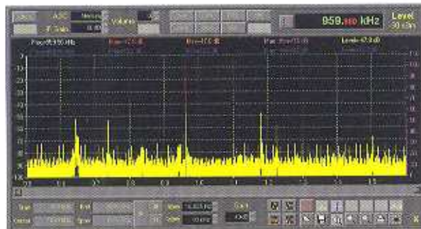
One of the many integrated spectrum analysis functions

There are numerous modulation modes, variable IF bandwidth 1 Hz to 15 kHz, two spectrum analyzers with 16 Hz resolution, graphically controlled IF shift, notch and audio filter, and noise blanker. The built-in recorder can record and play back demodulated audio as well as the IF signal, which means that it is possible to "re-receive" the same signal again and again with different IF filter bandwidths, notch and audio filter, noise blanking or demodulator settings, to arrive at the best possible reception of a weak or interference-prone signal.